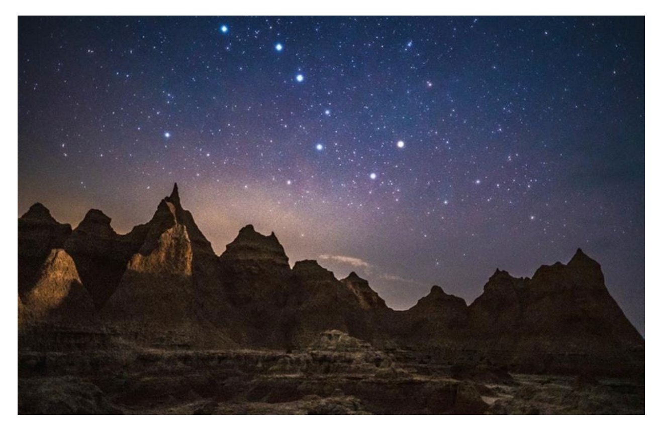
THE CLEAR NIGHTTIME SKIES IN BADLANDS NATIONAL PARK IN SOUTH DAKOTA.