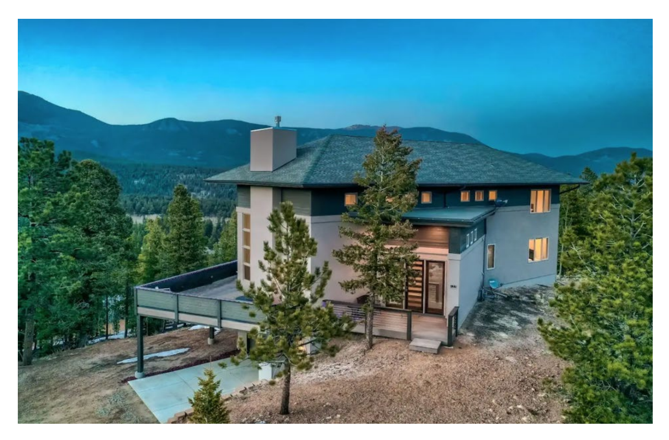
SKYTOP MOUNTAIN HOUSE IN BAILEY, COLORADO | SKYTOP MOUNTAIN HOUSE