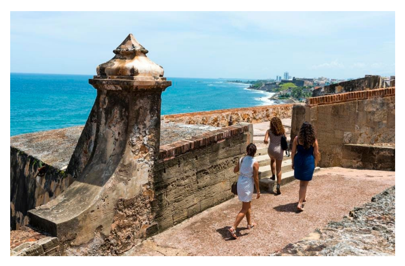
EXPLORING CASTILLO SAN FELIPE DEL MORRO, A 16TH-CENTURY SPANISH FORT IN SAN JUAN, PUERTO RICO.