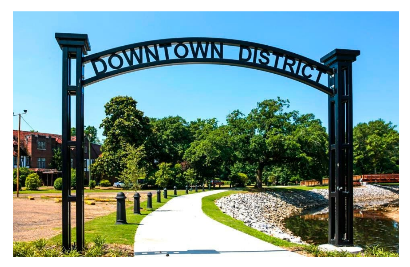
UP-AND-COMING HATTIESBURG, MISSISSIPPI.