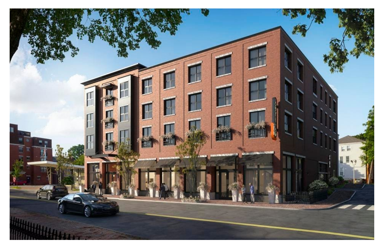
A RENDERING OF THE LONGFELLOW HOTEL, WHICH WILL OPEN THIS SUMMER IN PORTLAND'S HISTORIC WEST END. | LEONARDO R. MERLOS