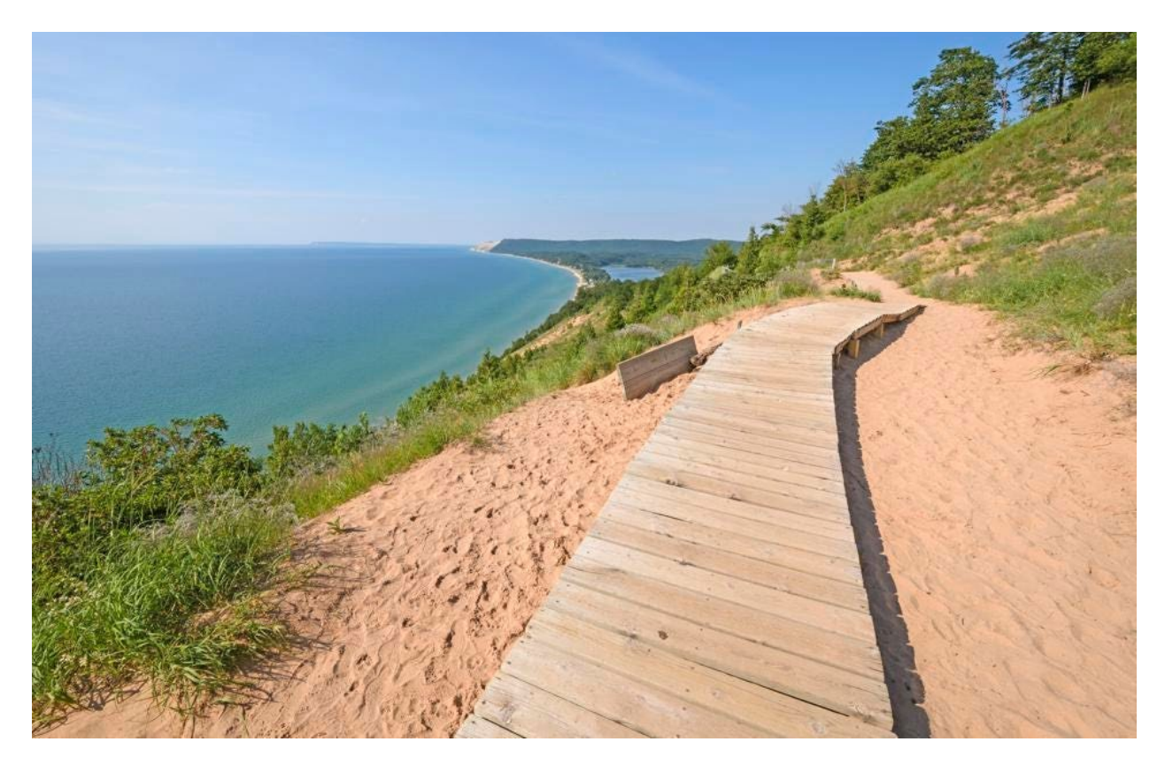
A SAND DUNE TRAIL IN MICHIGAN'S SLEEPING BEAR DUNES NATIONAL LAKESHORE.