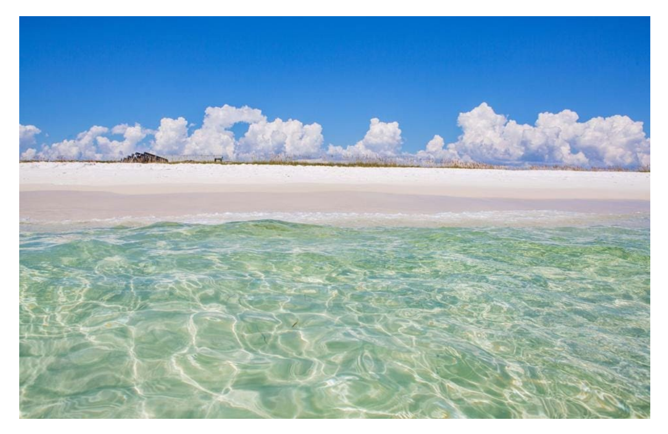
THE CLEAR WATERS OF FLORIDA'S HENDERSON STATE PARK. | DESTIN-FORT WALTON BEACH