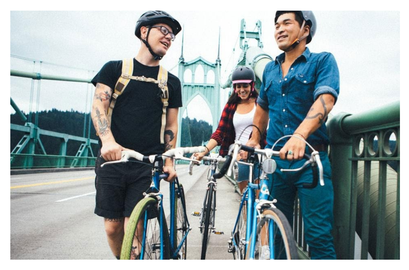
EXPLORING PORTLAND, OREGON BY BICYCLE ON THE SAINT JOHNS BRIDGE.