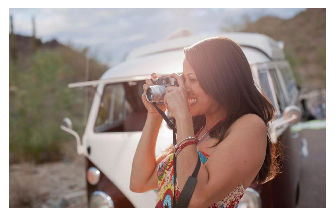
ROAD TRIPPING IN PHOENIX, WHICH IS ONE OF THE BEST PLACES TO TRAVEL IN THE US IN 2023.

This year, the top choices for where to go span the country from coast to coast, ranging from seaside escapes to mountain hideaways to urban hot spots, with some surprises thrown in along the way. Compare these choices to 2022's list of the <u>best</u> <u>places to travel in America</u>, and it's clear that the U.S. is the travel gift that keeps on giving.