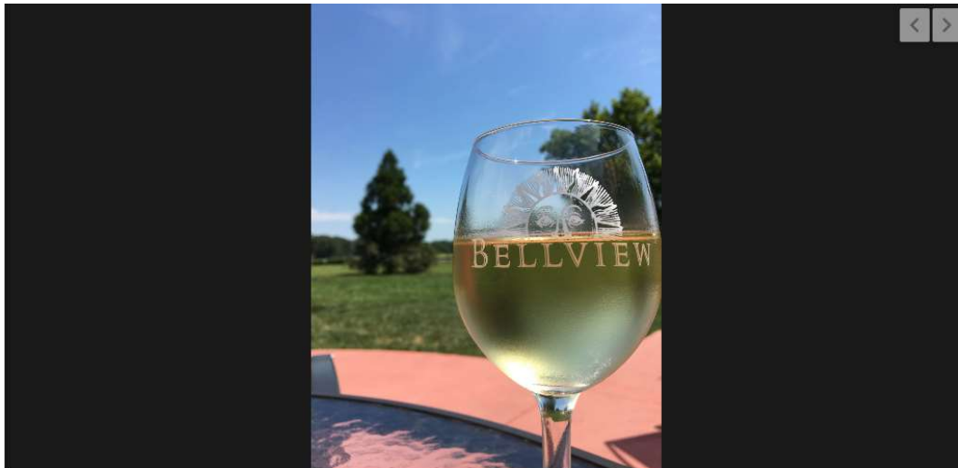
Bellview Winery in nearby Landisville, N.J., has more than two dozen wines.

Tours of the vineyard and winery are also available and cost $20. Masks are required except while seated at a table. Single-use cups will be provided, but the winery highly suggested that guests bring their own glasses. Only one person from each group may enter the winery to buy wine. Pets are allowed but must be on a leash.