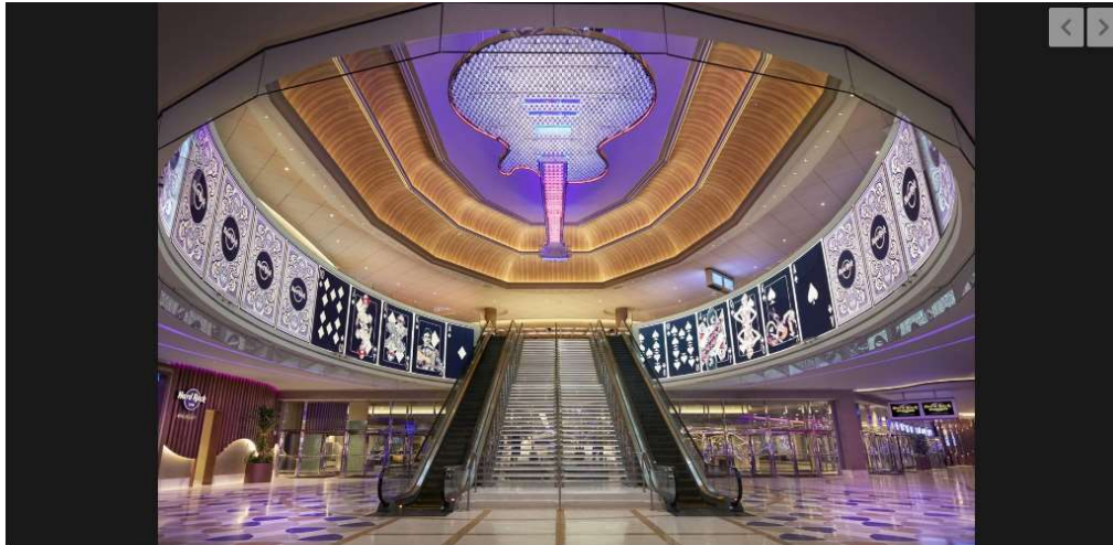
The Hard Rock Hotel & Casino Atlantic City is known for hosting A-list performers.

Known for world-class entertainment and events, Atlantic City offers comedy shows, pageants, family-friendly theater and more. The music-inspired Hard Rock Hotel & Casino has hosted hundreds of A-list entertainers over the years, including Amy Schumer, Blake Shelton and Pat Benatar. It also takes lodging to the next level with fine dining and a casino with more than 2,000 slot machines, 120 table games and opportunities to place bets on sporting events with Sportsbook.