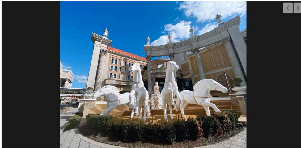
Try your hand at table games or slot machines at Caesars Atlantic City.

Take a chance on what Atlantic City has to offer this summer, from nostalgic days on the boardwalk and beach to exciting nights in the casinos.