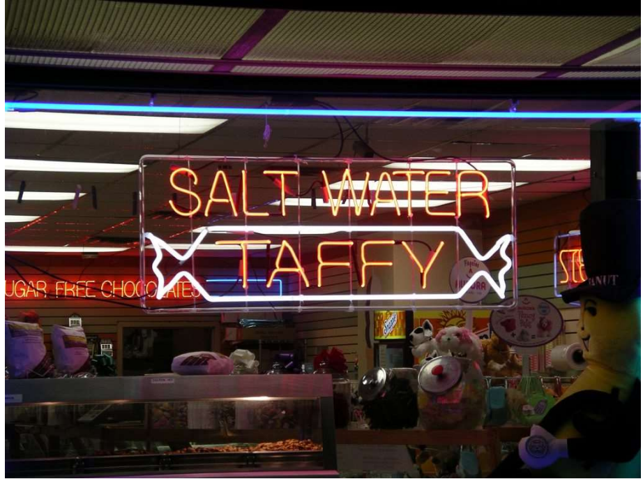
Salt water taffy, originated in Atlantic City, is featured in a number of shops

Not a beach lover? Then walk or jog along the over six-mile-long boardwalk that's up to 60 feet wide in spots, and made of thousands of wooden planks laid on concrete-and-steel pilings. The first boardwalk was built in 1870 to keep visitors from dropping sand on hotel carpets. Today's expanded boardwalk is surrounded by restaurants, game rooms, gift shops, and stores selling Atlantic City's famed salt-water taffy, fried sugar-coasted funnel cakes, and just about any food you may be craving –including pizza, subs, ice cream and hoagies. Any food you may crave can be found here –and also in the top casino restaurants.