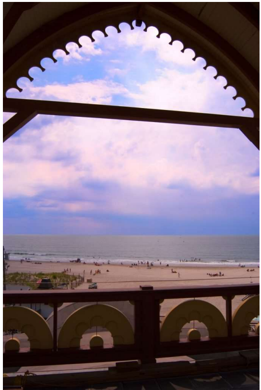
View of the beach and Atlantic Ocean from the howdah of Lucy the Margate Elephant

The thousand-foot long Steel Pier, built in 1898, features live music, games, and rides –including a Merry-Go-Round, Roller Coaster, and a giant Ferris wheel for thrills and great views. Food stands abound, and dozens of events are held here year-round.