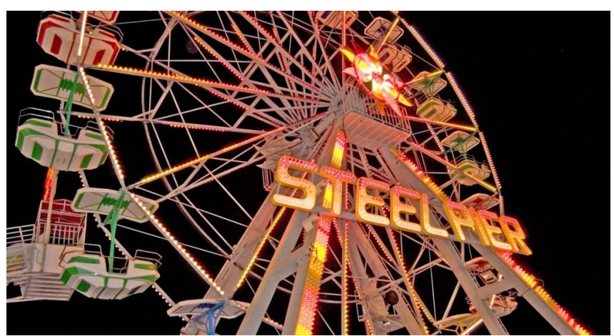
The Ferris wheel is a Steel Pier favorite