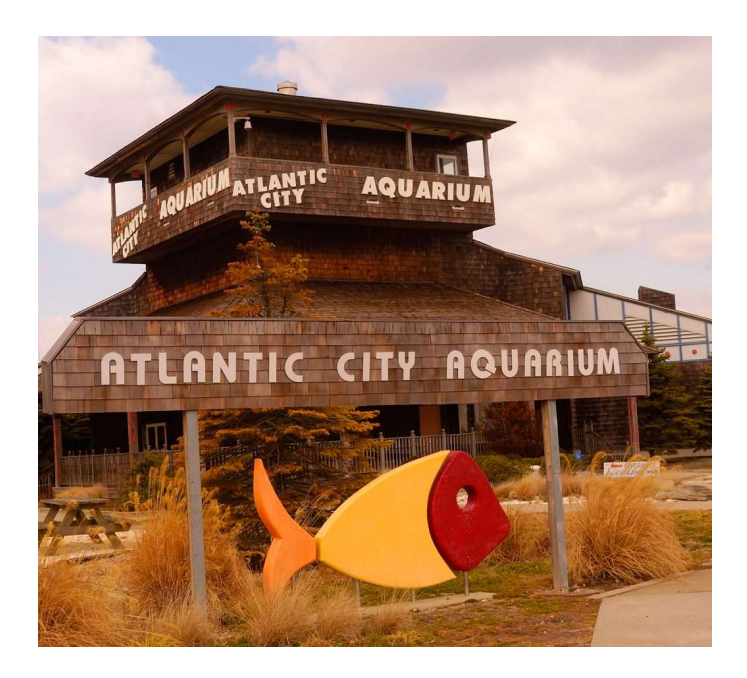
Entrance to Atlantic City Aquarium at Historic Gardner's Basin

Atlantic City Aquarium at Historic Gardner's Basin is fantastic and a fun, educational place with over a hundred varieties of fish and marine animals; a "Please Touch" tank containing Horseshoe Crabs and Sea Urchins. Other exhibits contain live moray eels and seahorses. A Live Dive Feeding Show and an Animal show are on tap, plus much more.